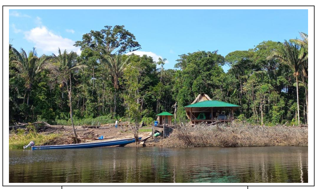
LAGARTO COCHA RIVER CAMPSITE EQUIPPED WITH A SHOWER AND TOILET