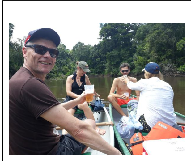
REFRESHING TIME DURING CANOEING

In order to maximize your Rainforest experience we manage small groups of maximum 10 people per guide.