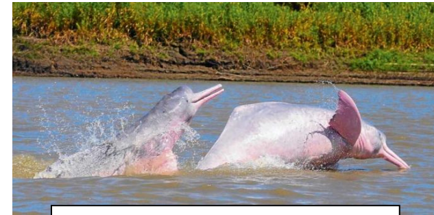
PINK RIVER DOLPHIN – INNIA GEOFRENSIS