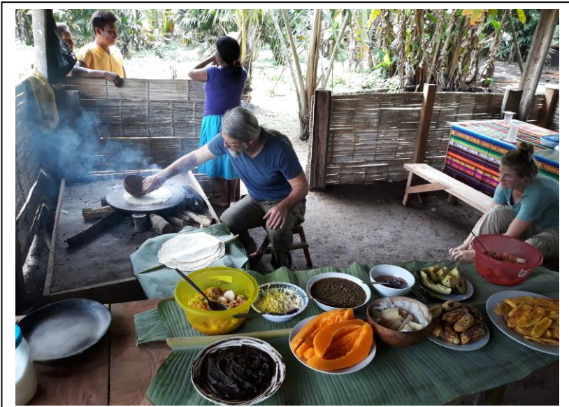
YUCA BREAD - FRESH FOOD MAKES A SPLENDID CAMPING DINNER