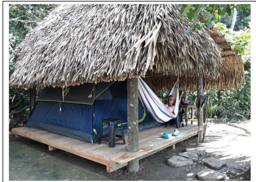
SECOYA TENT CAMP – SPACIOUS TENTS